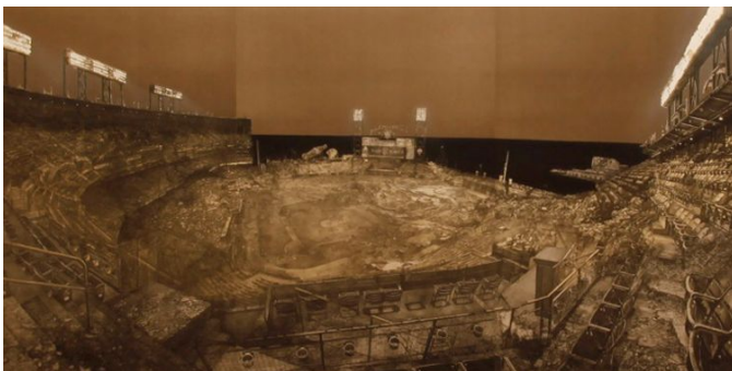
4. Hisaharu Motoda, Foresight-Stadium (AT & T Park, San Francisco Giants), 2011, lithograph, 88 × 178.5cm