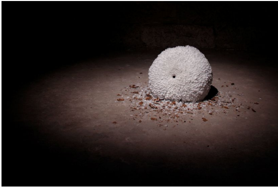
5. Jeremy Bakker, Here with you , 2011, bee wax, beehive, dimension variable