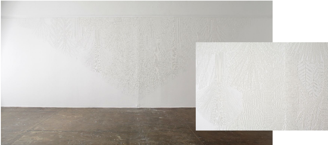
1. Ai Sasaki, Invisible island , 2010, royal icing sugar (sugar, egg white, lemon), 315 × 900cm