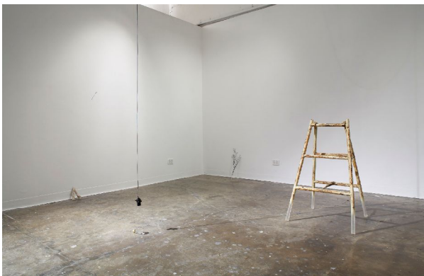
7. Nobuaki Onishi, ago no hone, kugi, eda, khatatsu, happa, yuushitessen, denkyu , 2010, painting on resin, dimension variable