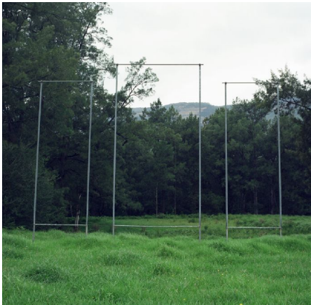
6. Kiron Robinson, Untitled.1 (from the Westward Series) , 2010, chromogenic print, 75 × 75cm